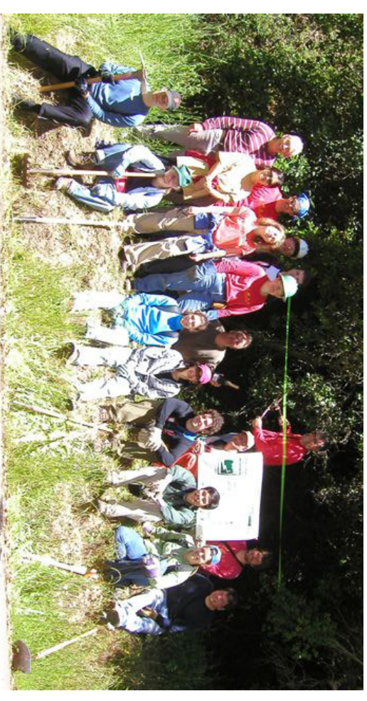
Trail Center Volunteers celebrate the opening of the Candelabra Redwood Trail at Butano State Park.

In addition to these tasks, a lot of brushing, clearing and poison-oak