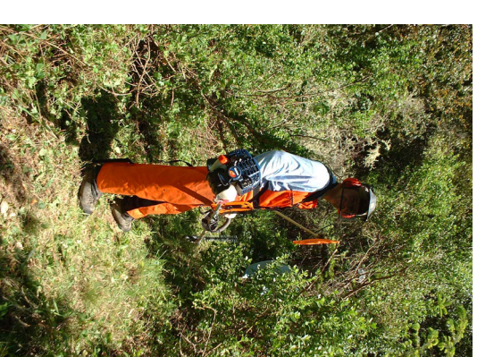
Look out poison oak - here comes Dave Croker!