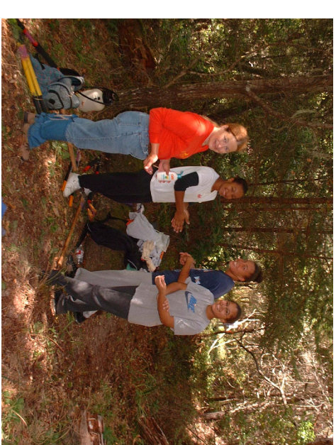
Volunteers at the September 10, 2005 build apply bug repellent in preparation for a productive work day.