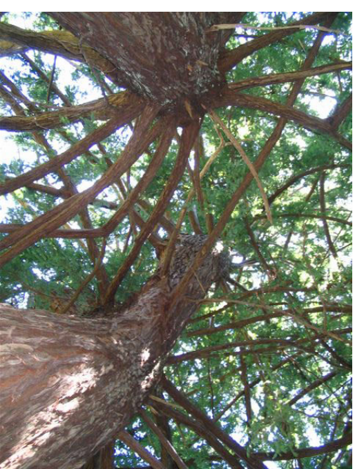
View of the top branches of the Candelabra Redwood, from the top of the main trunk.